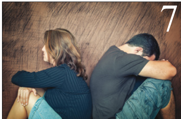
Taraji P. Henson image