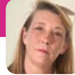
Adele PIN: 3622

Choose a reader to begin your journey Pick from our many talented psychics, all with different techniques