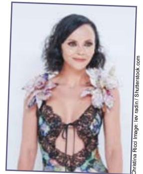
Christina Ricci

The Cat Full of Spiders tarot deck is now available for pre-order, including in the UK, and it will be officially released on September 3, 2024.