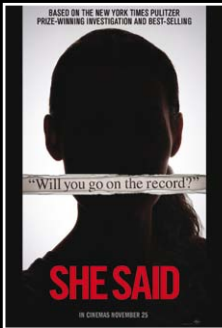
Carey Mulligan